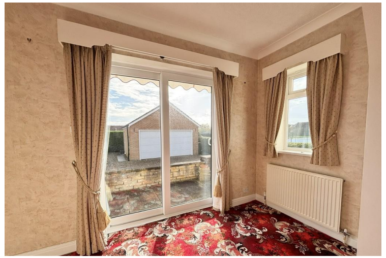
Dining Room extension