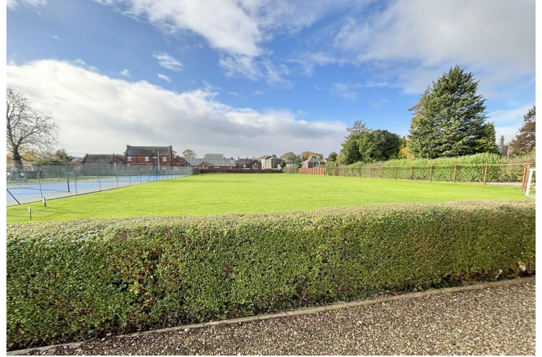
View over tennis courts