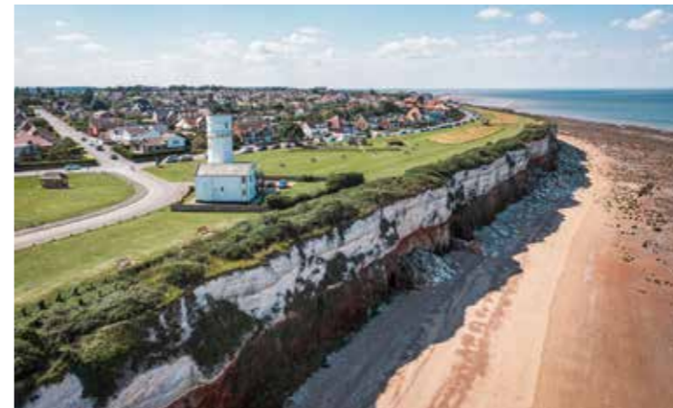
Hunstanton Aerial View

“Whether you are downsizing, retiring, or looking for a seaside escape, this well-positioned bungalow is easy to maintain and enjoy year-round.”