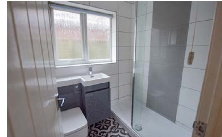
The modern shower room.

“The property has had recent upgrades including air source heating installed and a modern shower room.”