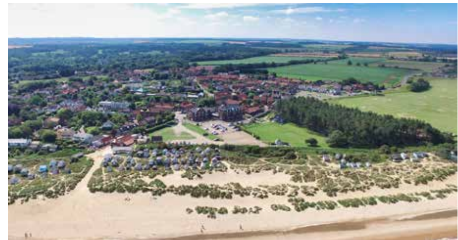
Old Hunstanton beach and dunes.

"The fresh sea air draws you to one of the best beaches in Norfolk."