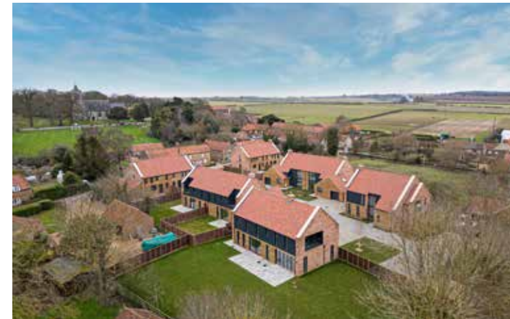
Admiral Barn at Jacob's Yard

“Admiral Barn enviably rests on one of the largest plots on the development.”