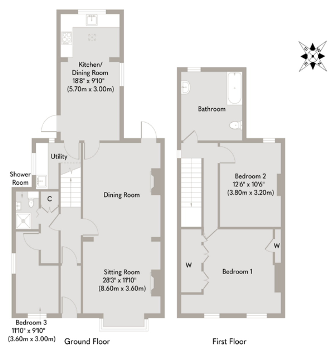
Ground Floor Approximate Floor Area 759 sq.ft (70.51 sq.m) First Floor Approximate Floor Area 509 sq.ft (47.33 sq.m) Approx. Gross Internal Floor Area 1268 sq.ft (117.84 sq.m)

Whilst every attempt has been made to ensure the accuracy of the floor plan contained here, measurements of doors, windows, rooms and any other items are approximate and no responsibility is taken for any error, omission, or mis-statement. This plan is for illustrative purposes only and should be used as such by any prospective purchaser or tenant. The services, systems and appliances shown have not been tested and no guarantee as to their operability or efficiency can be given. Copyright V360 Ltd 2023 | www.houseviz.com