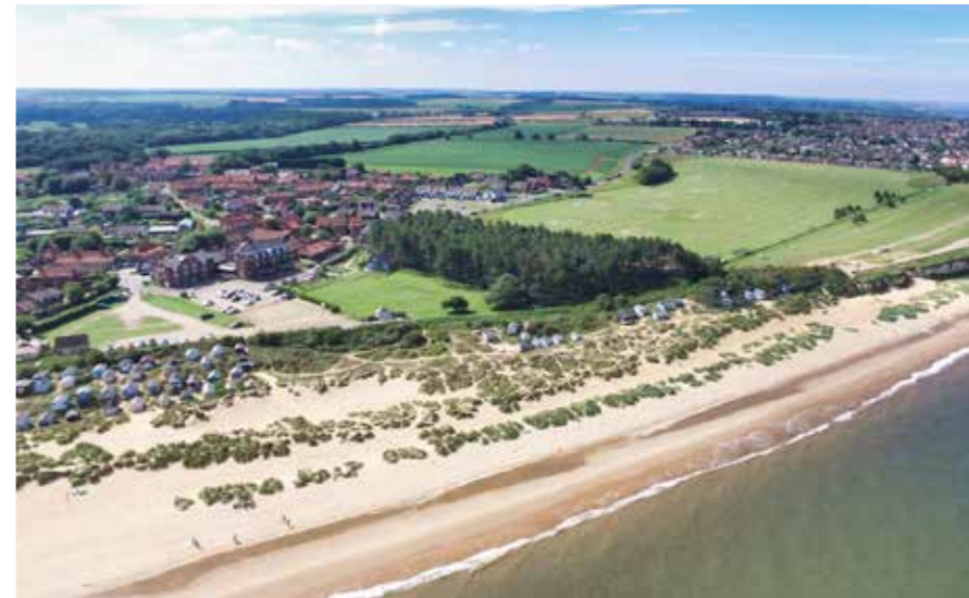
Old Hunstanton Beach.