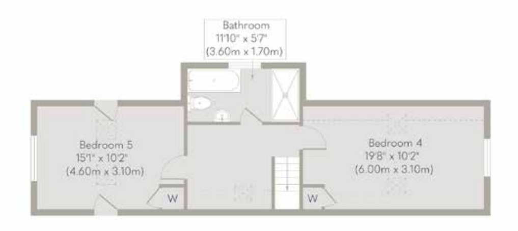
First Floor Approximate Floor Area 554 sq. ft (51.51 sq. m)