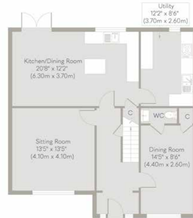
Ground Floor Approximate Floor Area 825 sq. ft (76.66 sq. m)

Whilst every attempt has been made to ensure the accuracy of the floor plan contained here, measurements of doors, windows, rooms and any other items are approximate and no responsibility is taken for any error, omission, or mis-statement. This plan is for illustrative purposes only and should be used as such by any prospective purchaser or tenant. The services, systems and appliances shown have not been tested and no guarantee as to their operability or efficiency can be given.