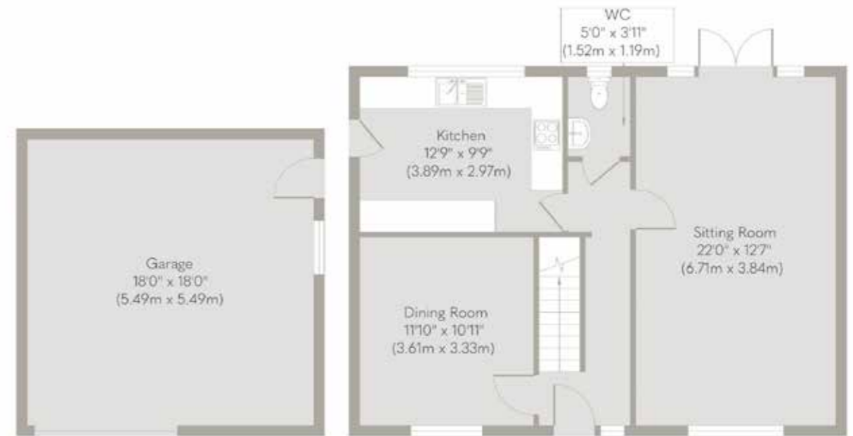
Garage Approximate Floor Area 324 sq. ft. (30.10 sq. m)