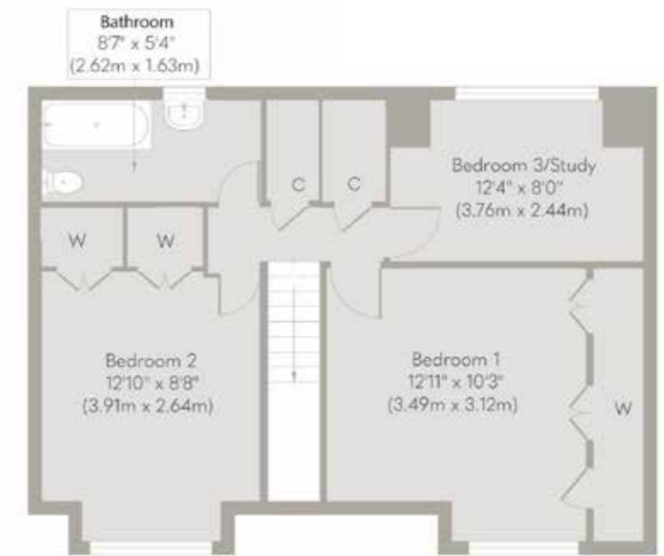
First Floor Approximate Floor Area 629 sq. ft. (58.41 sq. m)