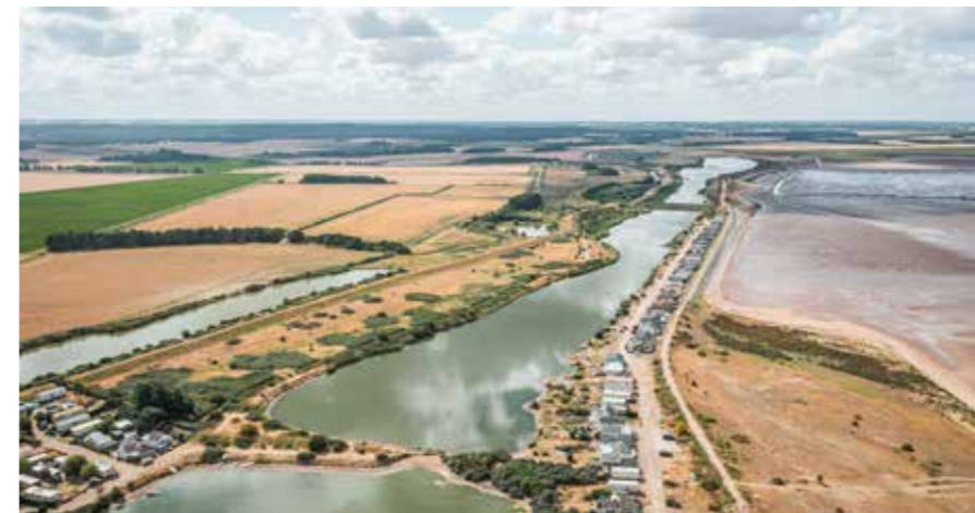
Snettisham Beach and lakes

"We love to explore the beach and the lakes..."