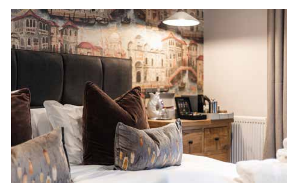
"It's evident in every room how well-maintained and beautifully dressed this property is."

With a renewed sense of vigour in recent years, Hunstanton is a place that attracts young families, professionals and entrepreneurs alike, along with those looking to enjoy their golden years and life at a slower pace. Find out why this is the perfect spot to discover your coastal bolthole.