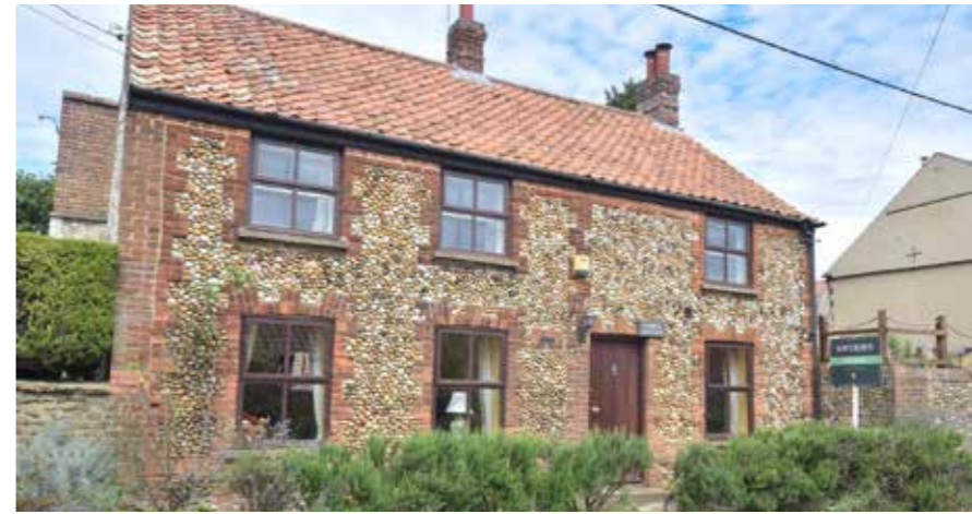
Cobble Cottage, Sedgeford.

“This has been an ideal holiday home for us. The property is characterful, spacious and homely.”