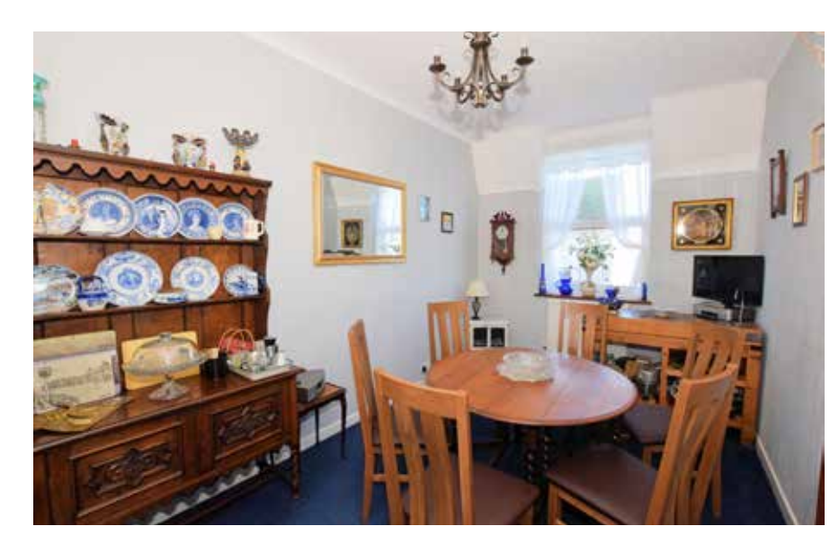
"A versatile home well-located for the perfect coastal lifestyle."