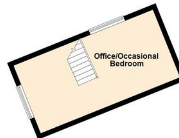
First Floor Approx. 19.6 sq. metres (210.8 sq. feet)

Total area: approx. 188.7 sq. metres (2030.9 sq. feet)