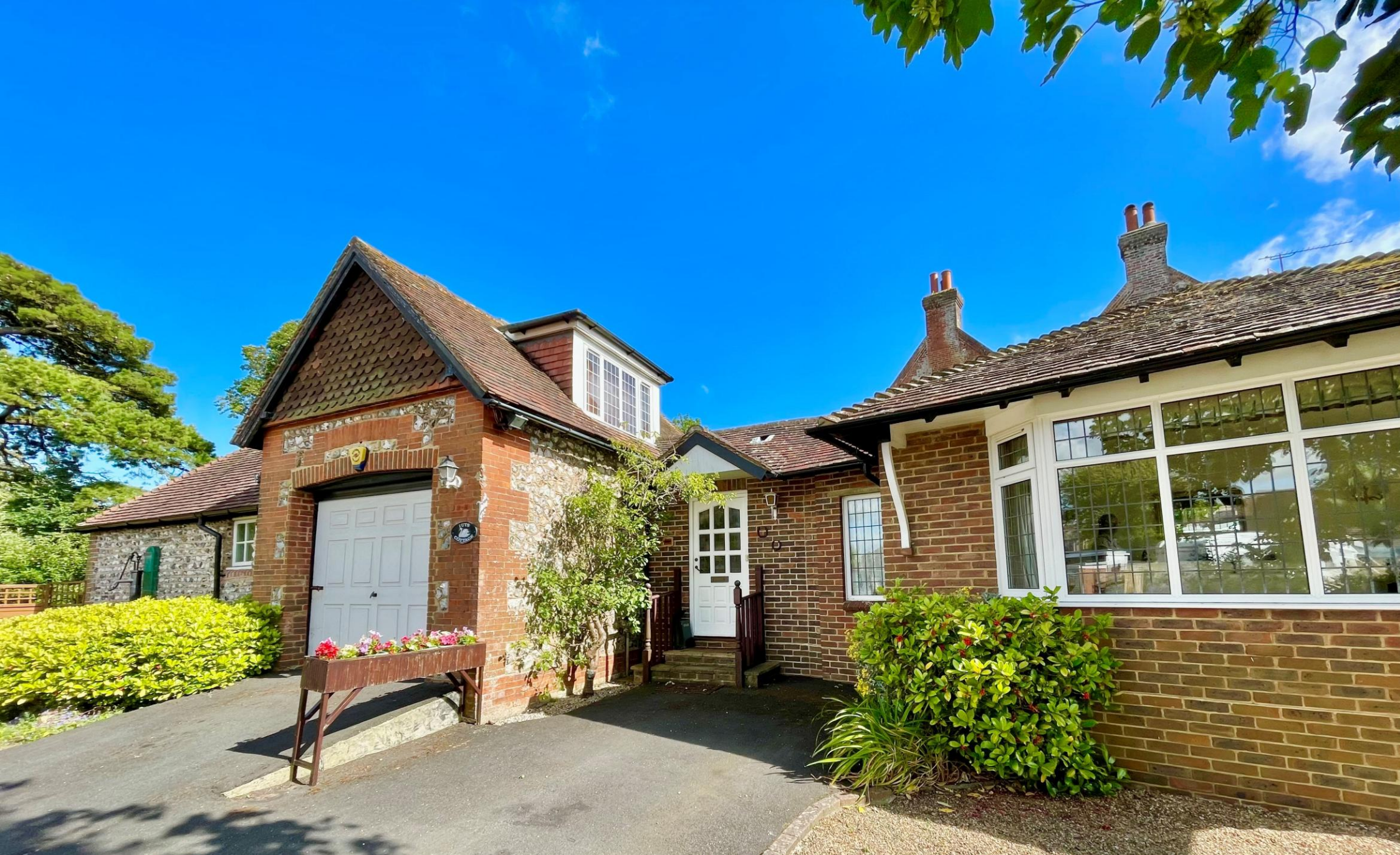
Tuts Cottage, Manor Close, East Preston BN16 1JF Guide Price £575,000 Freehold