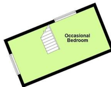
First Floor Approx. 19.6 sq. metres (210.8 sq. feet)

Total area: approx. 188.7 sq. metres (2030.9 sq. feet)