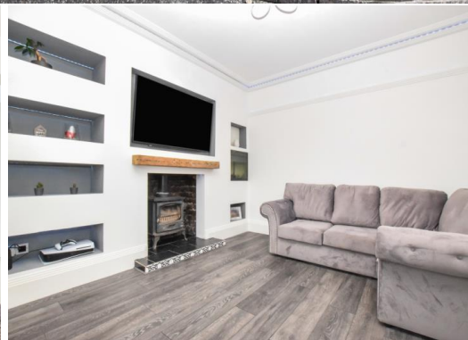
Beautifully Presented Open Plan Kitchen