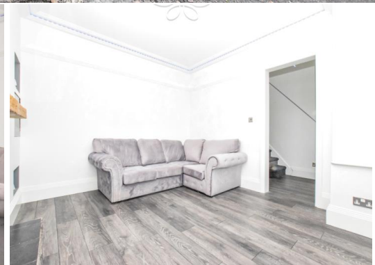
Ample Plot Viewing Advised