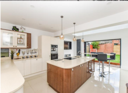
Three Bedroom Semi-Detached Home