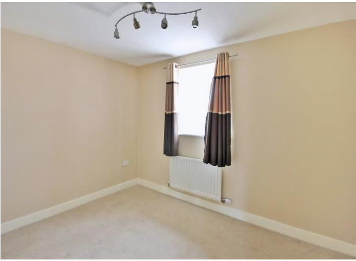
Bedroom 2 8' 2" x 10' 11" (2.49m x 3.32m) UPVC double glazed window with a rear facing aspect and central heating radiator.