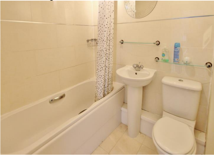
Family Bathroom A suite comprising of panelled bath with shower over, pedestal wash hand basin, low level wc, part tiled walls, tiled flooring and chrome ladder style radiator.