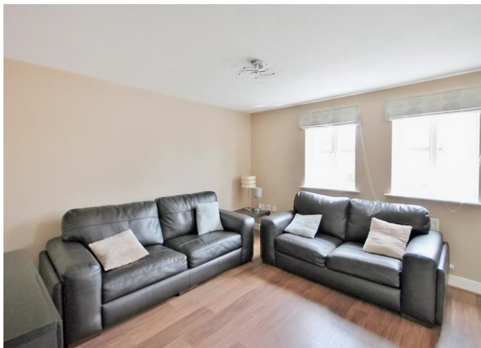
Lounge 13' 2" x 12' 1" (4.01m x 3.68m)

Two UPVC double glazed windows with a front facing aspect, laminate flooring and central heating radiator