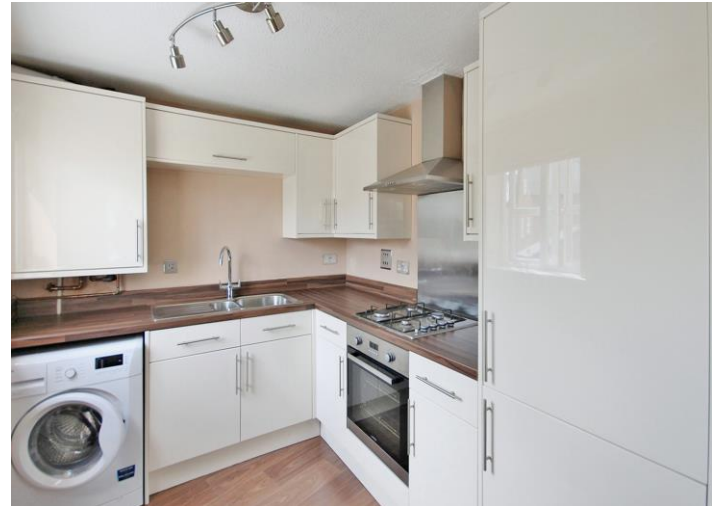
Kitchen 7' 2" x 9' 1" (2.18m x 2.77m)

Two UPVC double glazed windows with a front facing aspect, laminate flooring and central heating radiator