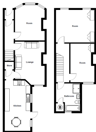
Total Area: 100.5 m 2 ... 1081 ft 2