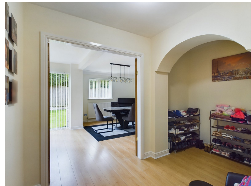
Sagar Fold, Aughton Total Approx. Floor Area 2508 Sq.ft. (233.0 Sq.M.)

Substantial and modern family property offering a flexible arrangement of space and attractively positioned at the end of a quiet cul-de-sac off of the popular residential road of Town Green Lane, Aughton. The property is modern and beautifully decorated throughout with the ground floor comprising of a bright and airy entrance hallway, cloakroom, living room, dining room, breakfast kitchen and utility room. Whilst to the first floor their is a large master bedroom with En-suite, three further double bedrooms and recently updated 4 piece family bathroom. Outside there are well maintained and lawed front and rear gardens with the front also offering ample parking provided by a double width block paved driveway and double attached garage. Viewing is highly recommended to fully appreciate this beautiful home.