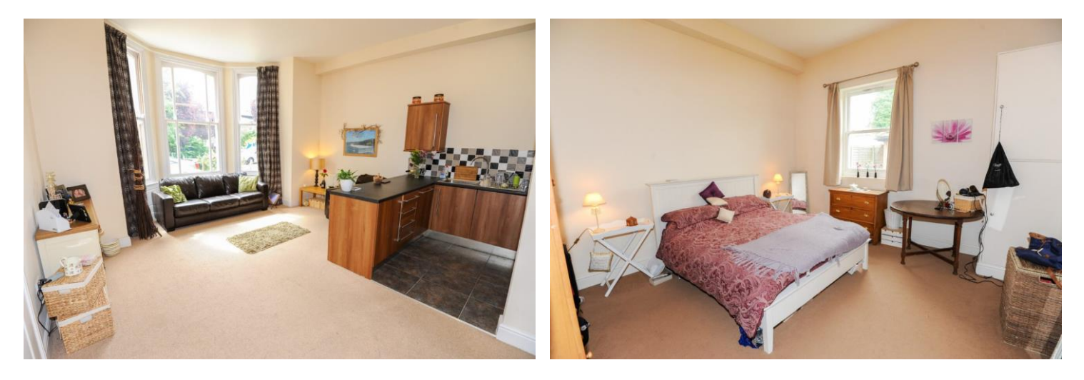
Flat 4 Living Room

Monday to Friday: 0900 – 1730 Saturdays: 1000 – 1300