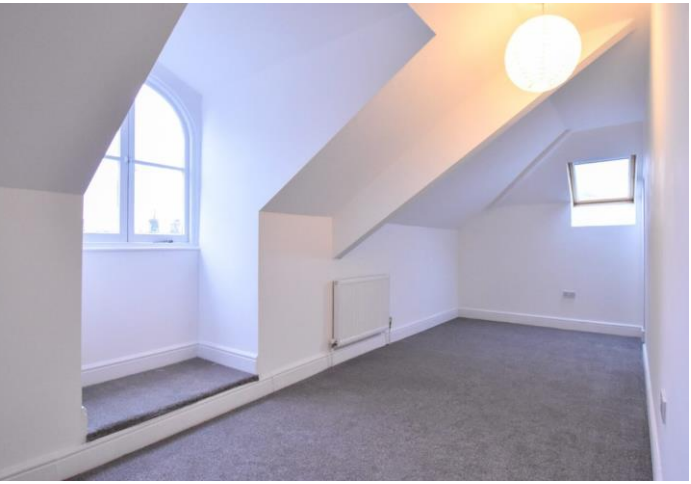
Flat 8 Bedroom 2