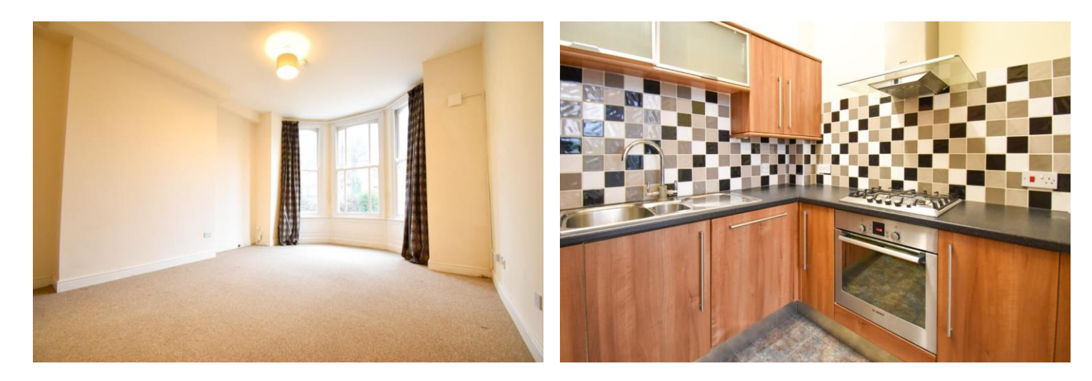
Flat 3 Living Room