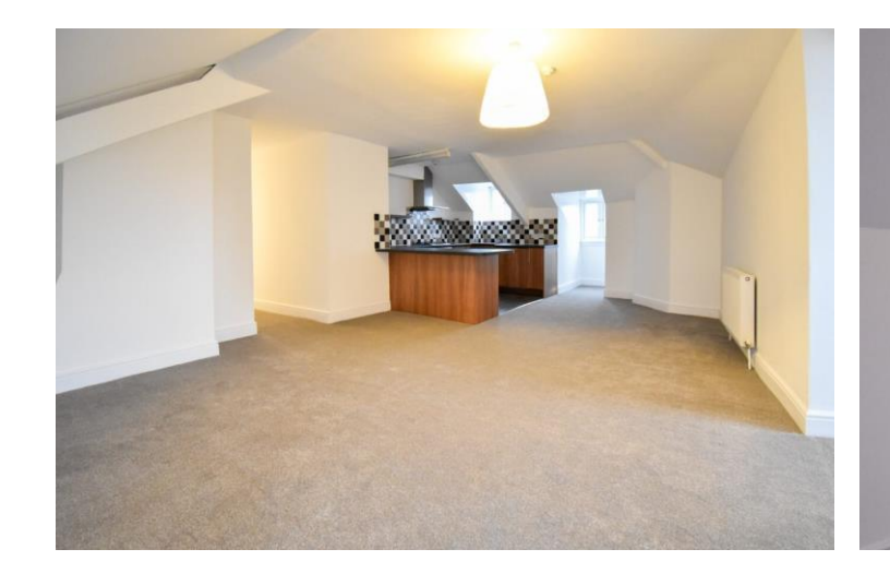
Flat 8 Living Room