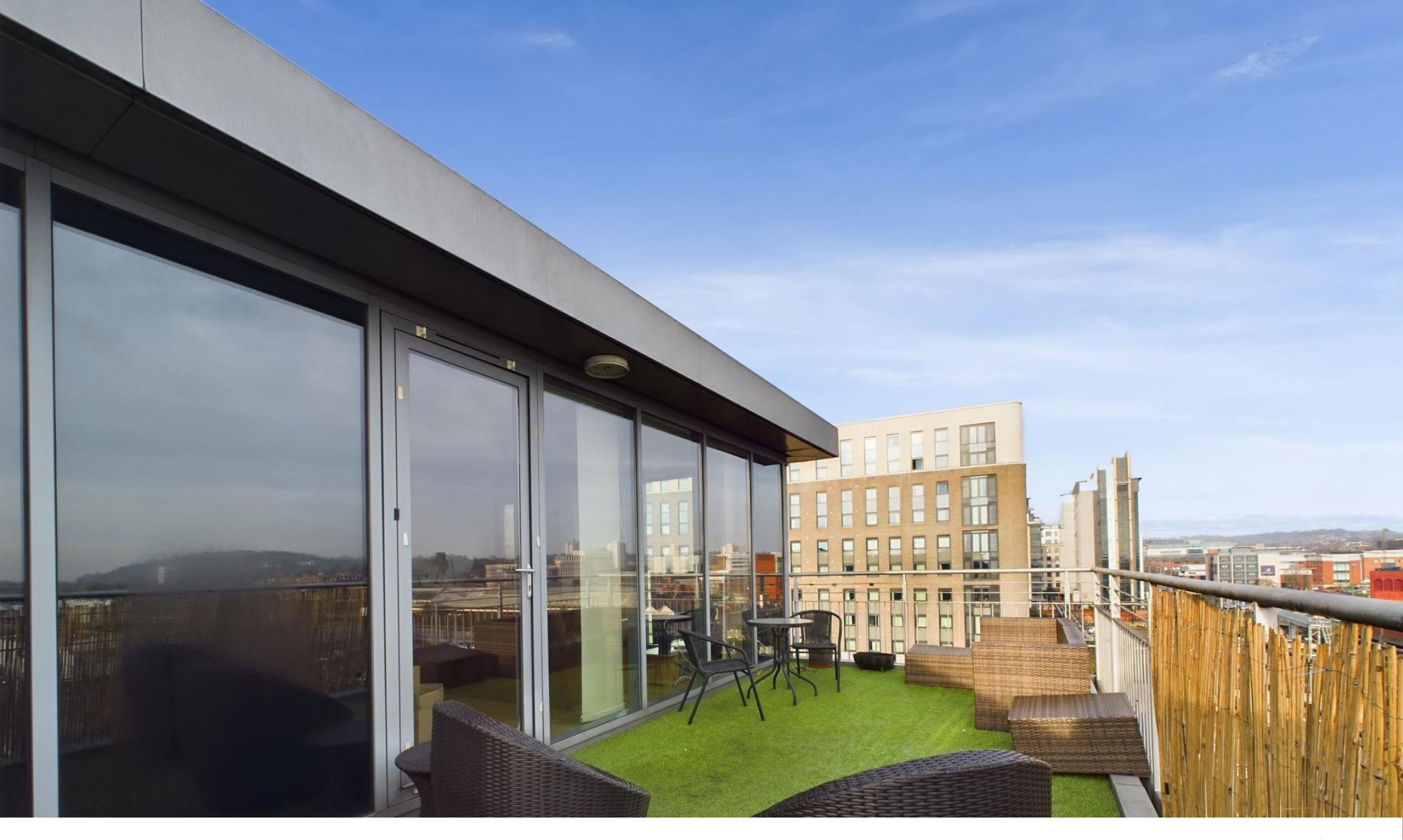
The Hicking Building, Queens Road, Nottingham, NG2 3BX Offers In Region Of £195,000 Leasehold