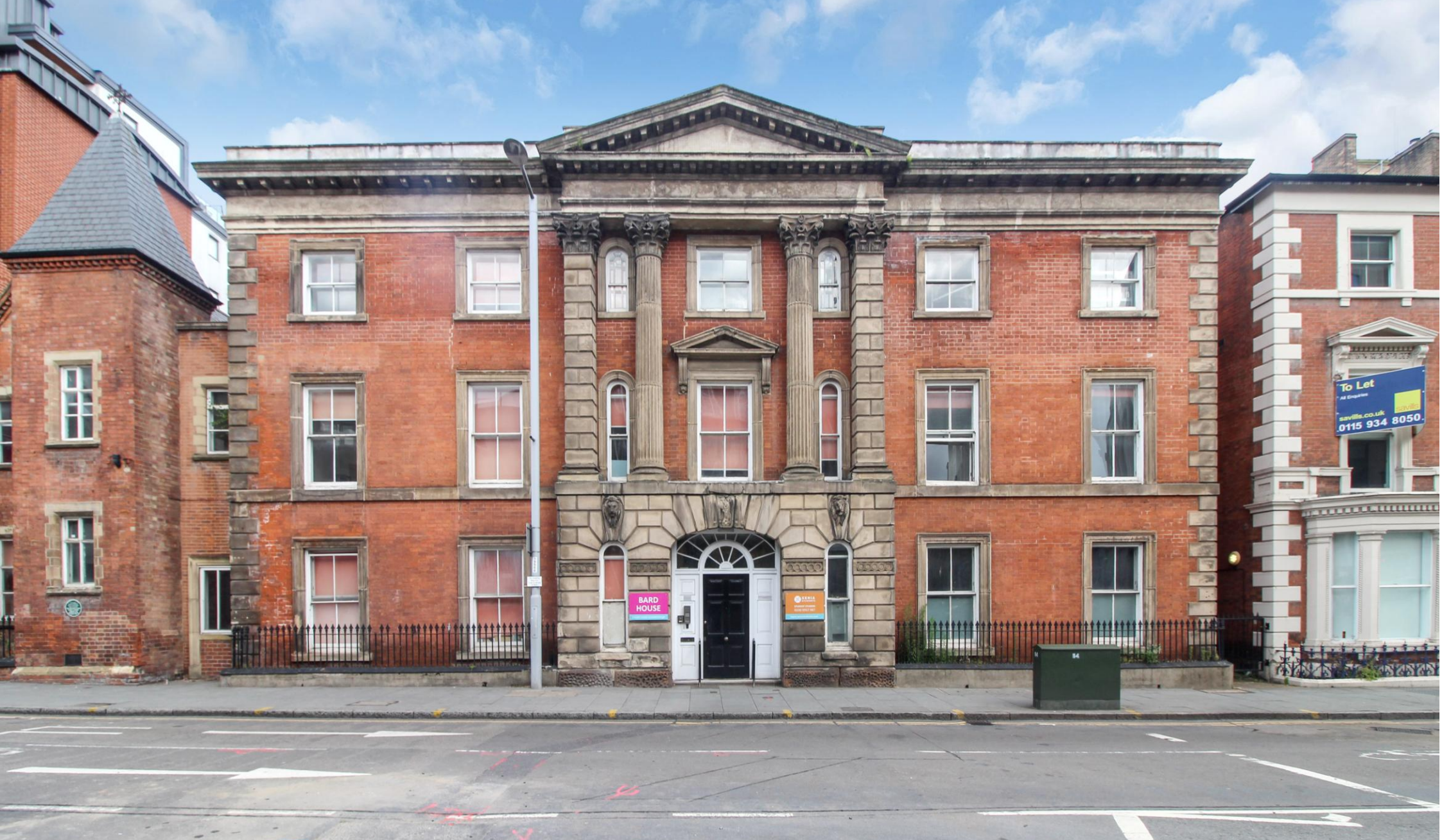
Bard House, Shakespeare Street, Nottingham, NG1 4AH £60,000 Leasehold