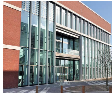
The Centre for Process Innovation