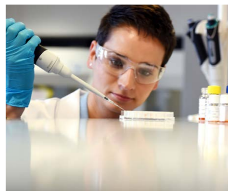
The National Horizons Centre