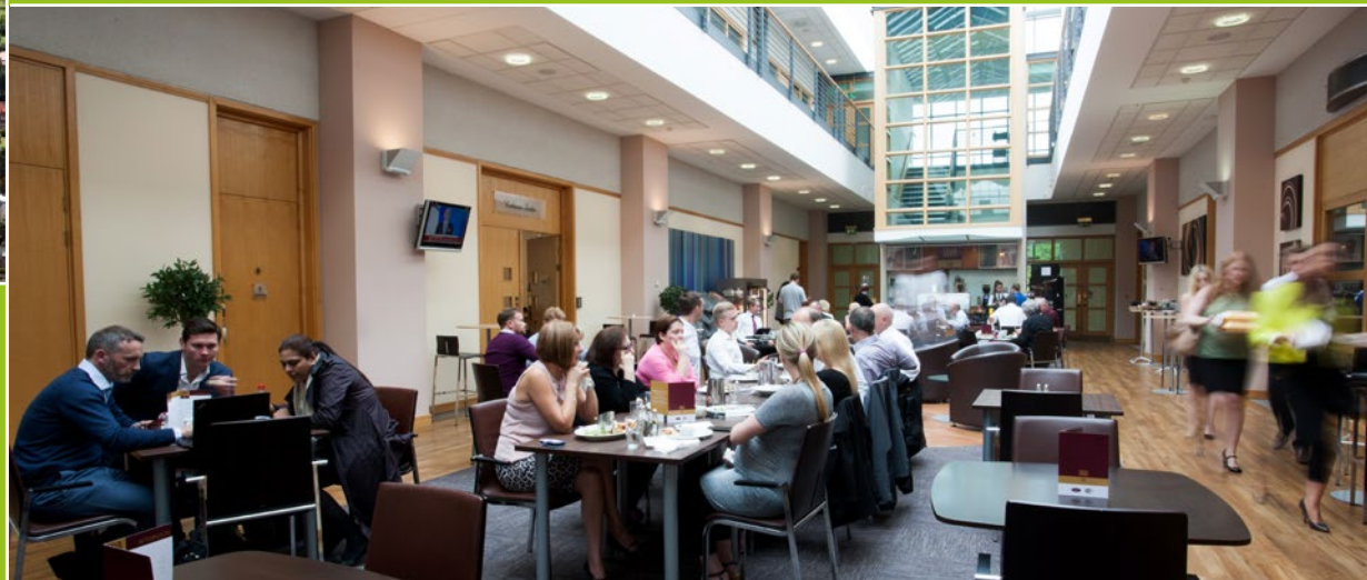
Wynyard Park House, Wynyard Business Park