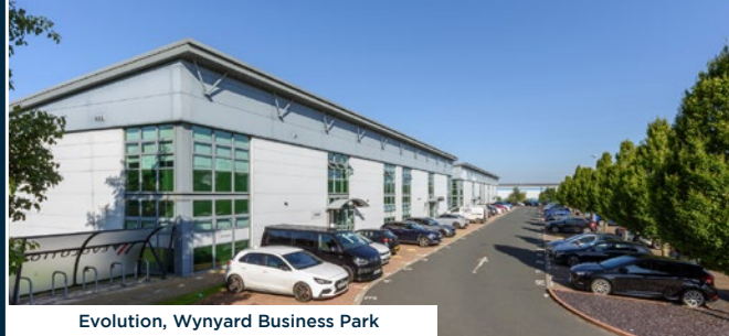
Evolution, Wynyard Business Park

Approximately 1,800 approval/under consideration