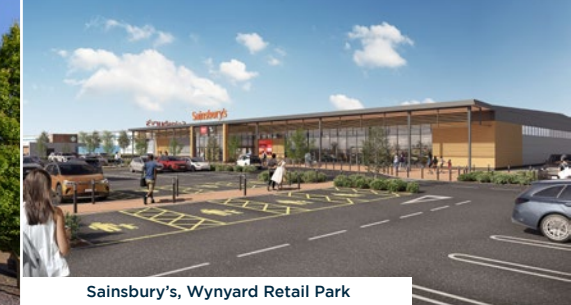
Sainsbury's, Wynyard Retail Park