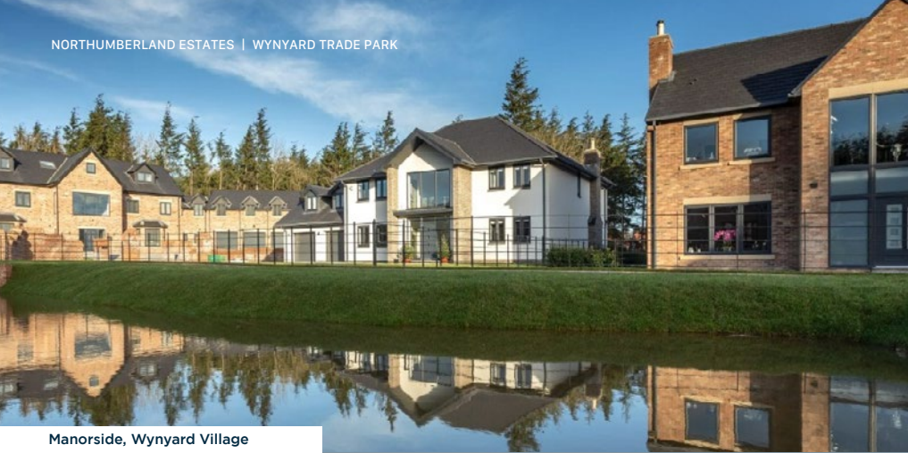
Manorside, Wynyard Village

Population of 500,022 in a 20-minute drive