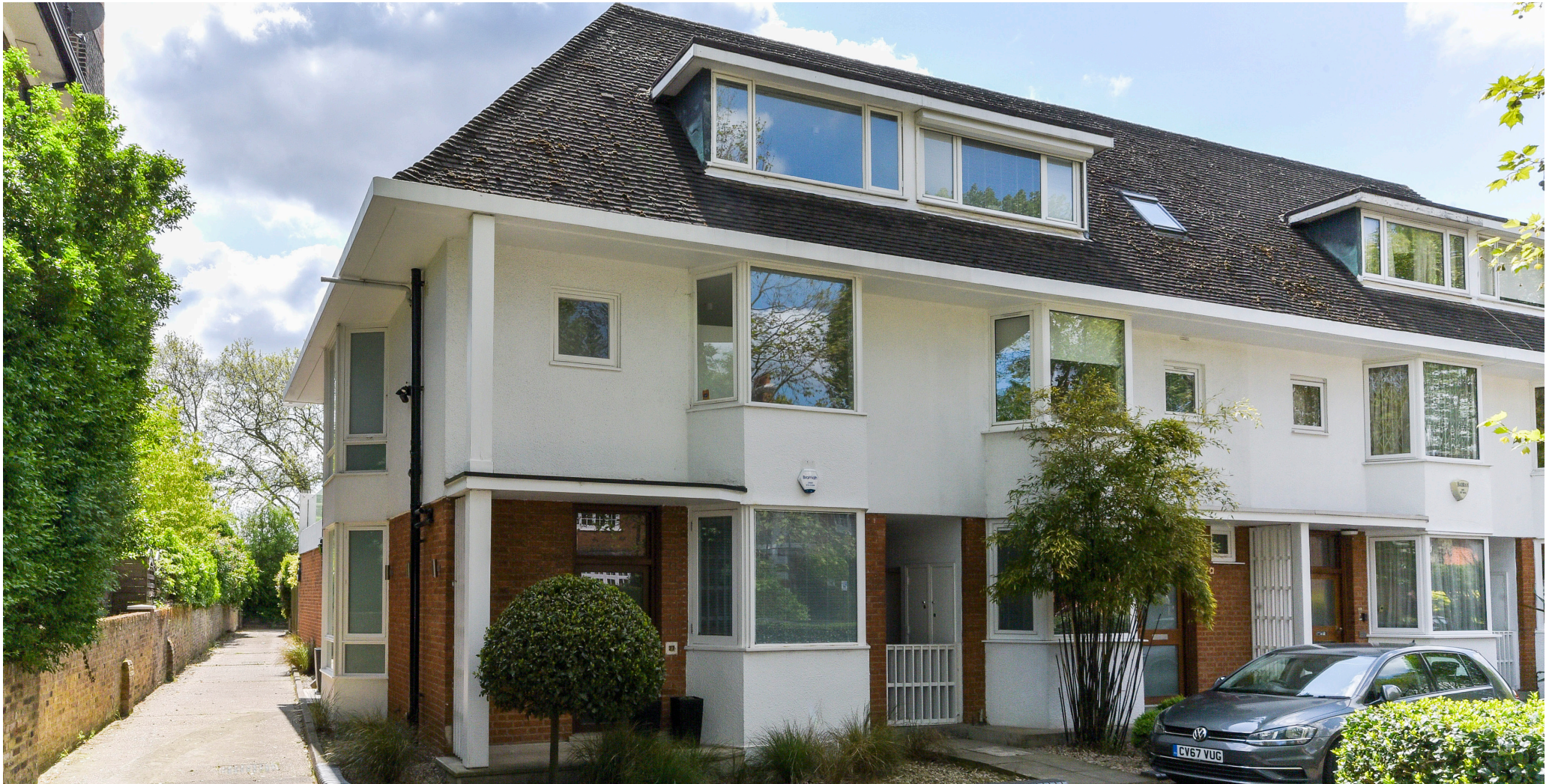
ELSWORTHY ROAD, Primrose Hill NW3