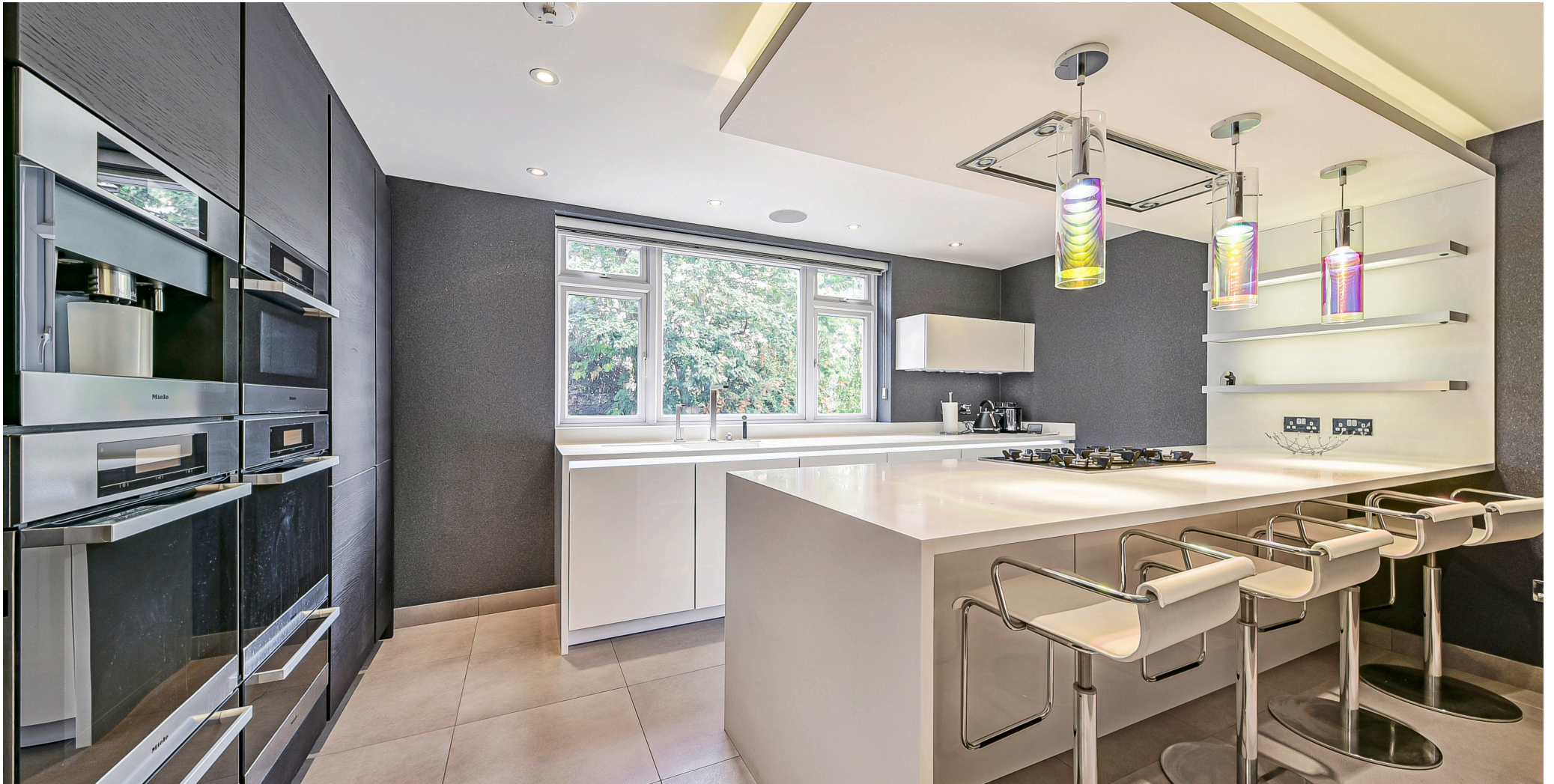
BUCKLAND CRESCENT, London NW3