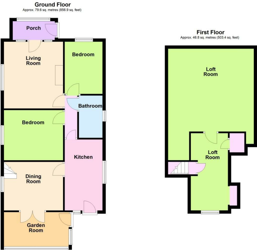
Total area: approx. 126.4 sq. metres (1360.3 sq. feet)