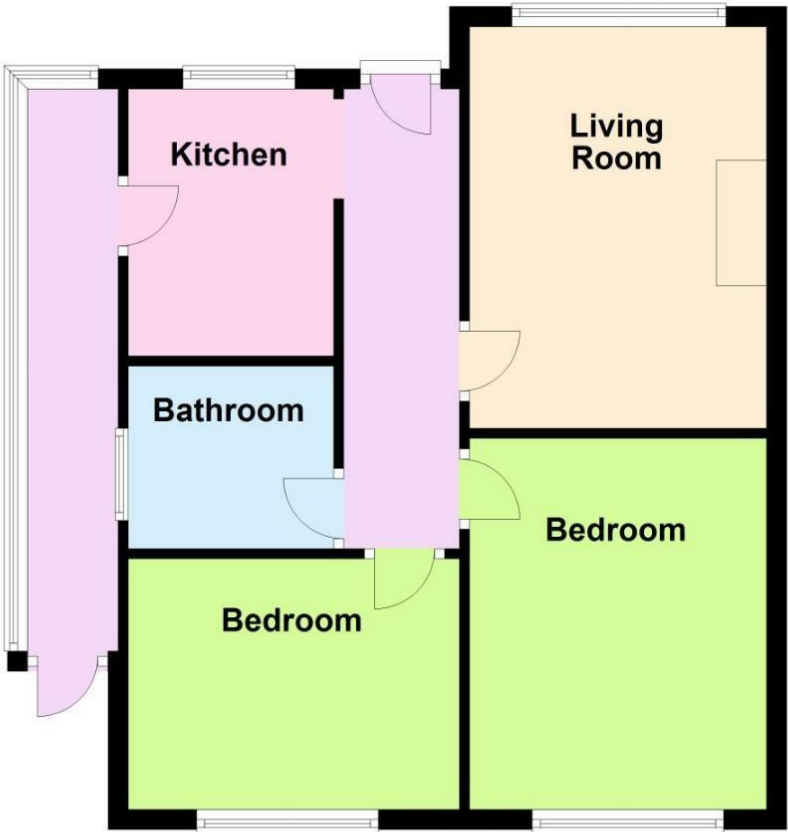
Total area: approx. 53.1 sq. metres (572.0 sq. feet)