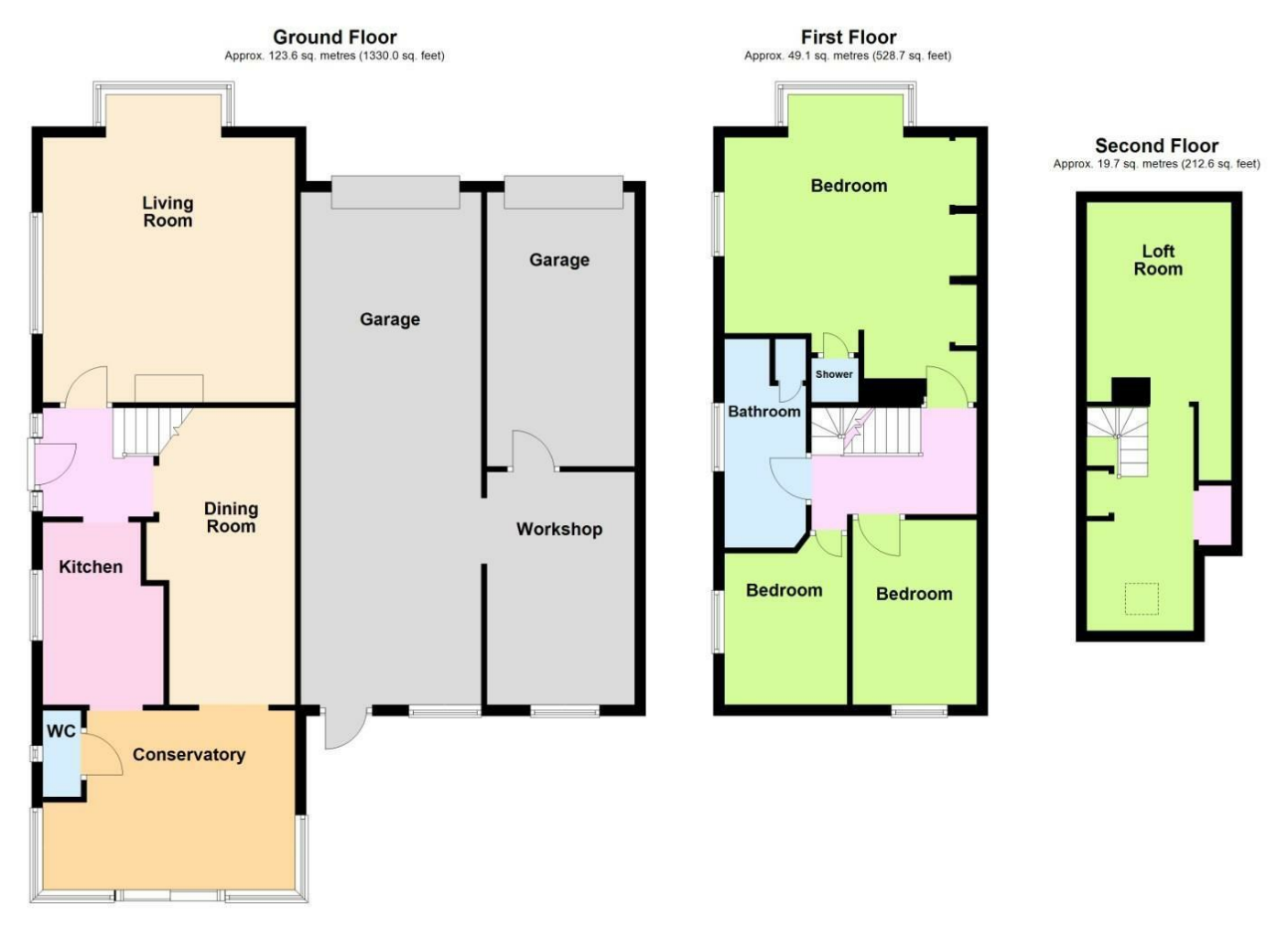
Total area: approx. 192.4 sq. metres (2071.4 sq. feet)