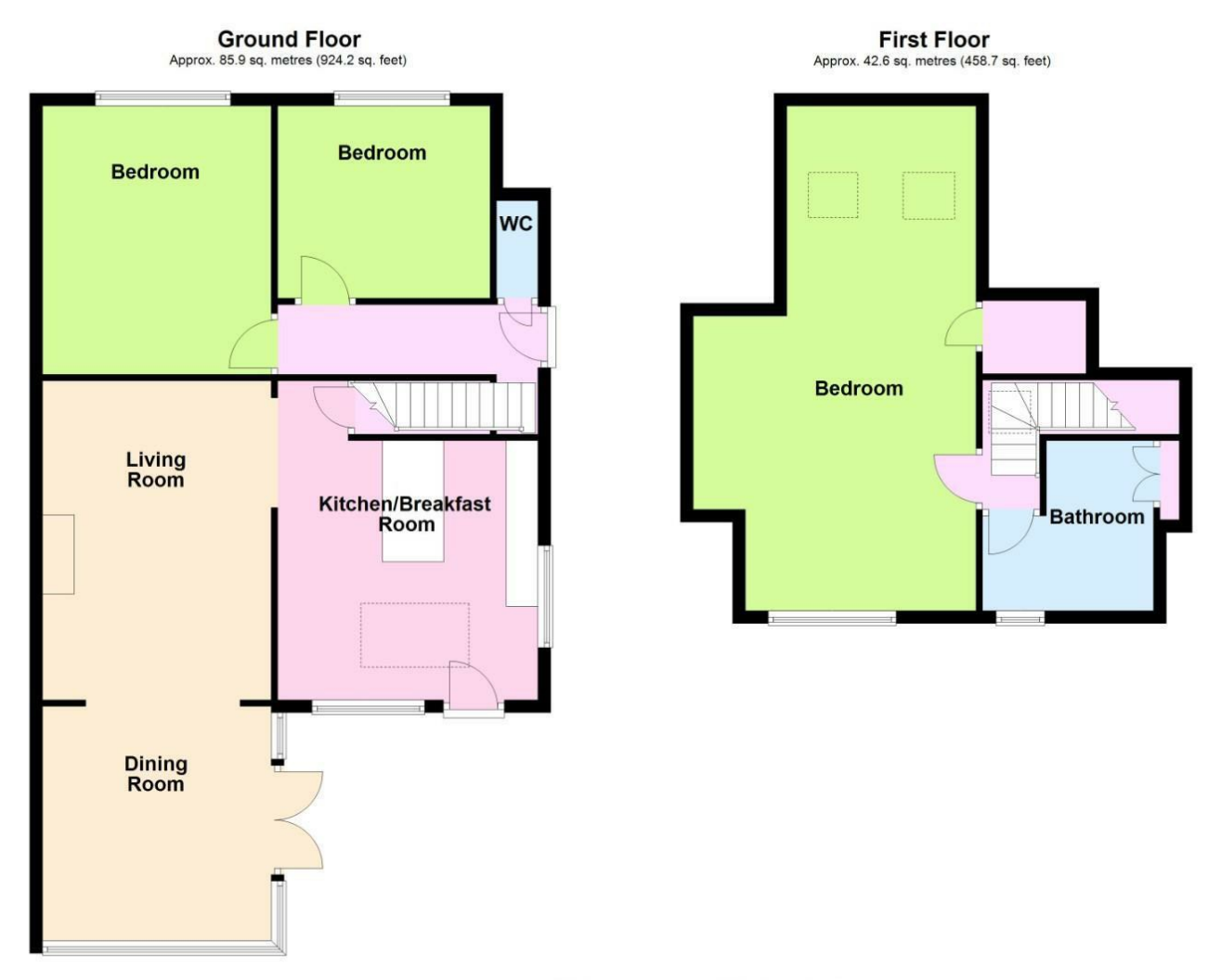
Total area: approx. 128.5 sq. metres (1382.9 sq. feet)