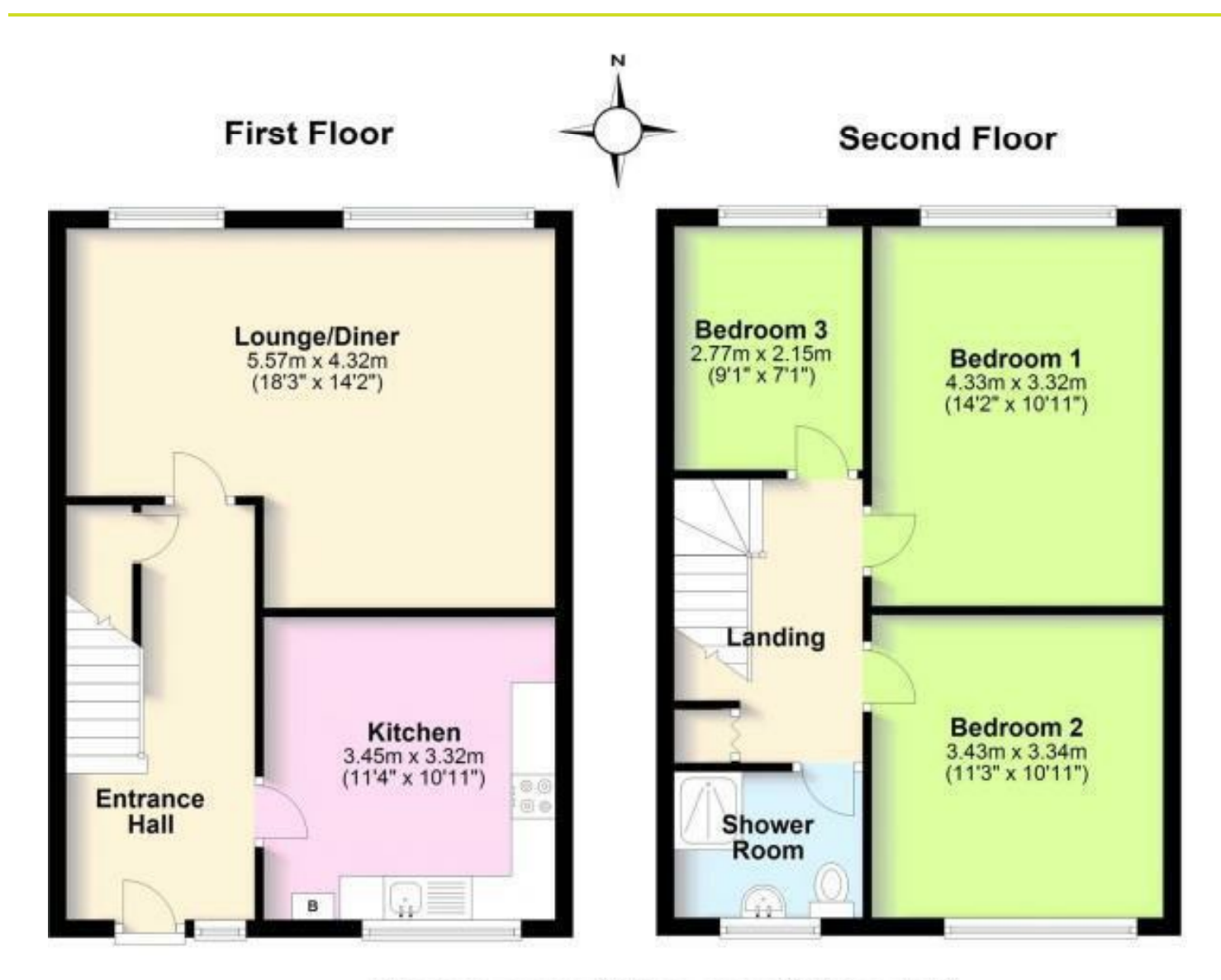
Total area: approx. 87.7 sq. metres (944.1 sq. feet)

Whilst every attempt has been made to ensure the accuracy of the floor plan contained here, measurements of doors, windows, rooms and any other items are approximate and no responsibility is taken for any error, omission, or mis-statement. This plan is for illustrative purposes only and should be used as such by any prospective purchaser.