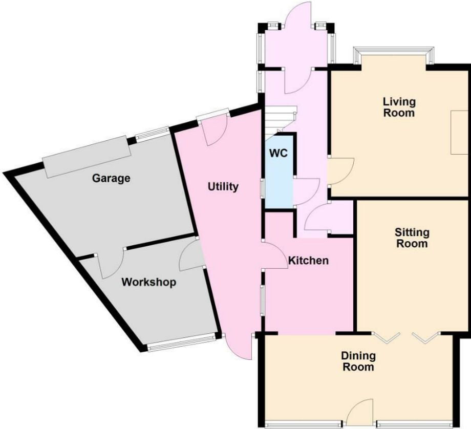
Ground Floor Approx. 92.8 sq. metres (999.0 sq. feet)