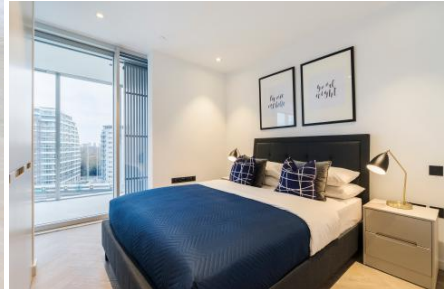
Halliday House, Battersea Power Station 1 Bedroom Apartment