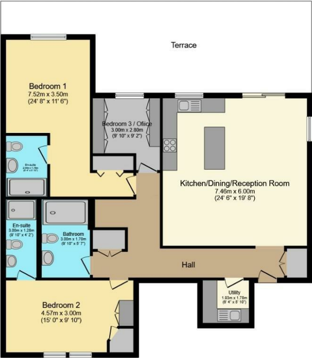
Floor Plan Floor area 121.7 sq.m. (1,310 sq.ft.)

Chasewood Park, Harrow on the Hill, HA1 3YP