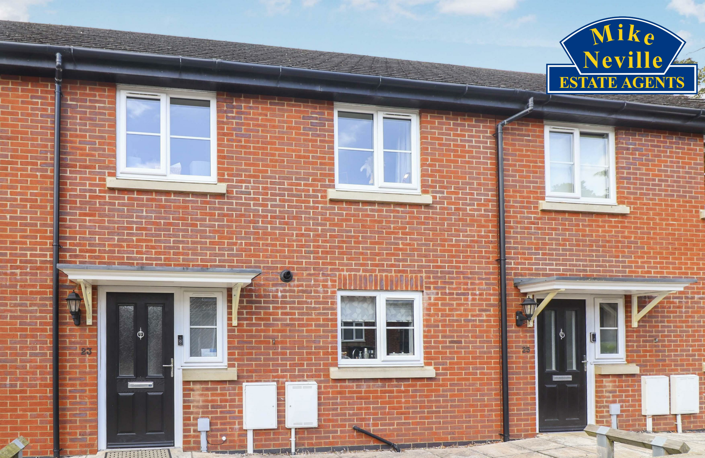
23 Harborough Way, Rushden, Northamptonshire, NN10 0LD