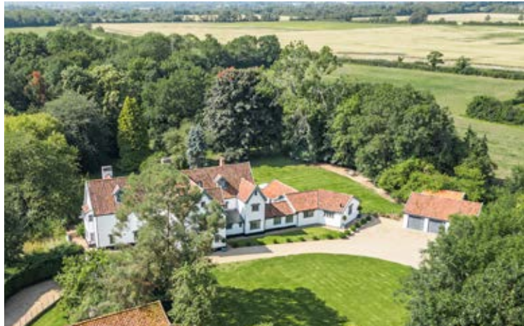
Orchard Farm House and surrounding countryside.

“Surrounded by enchanting woodlands with meandering walkways.”