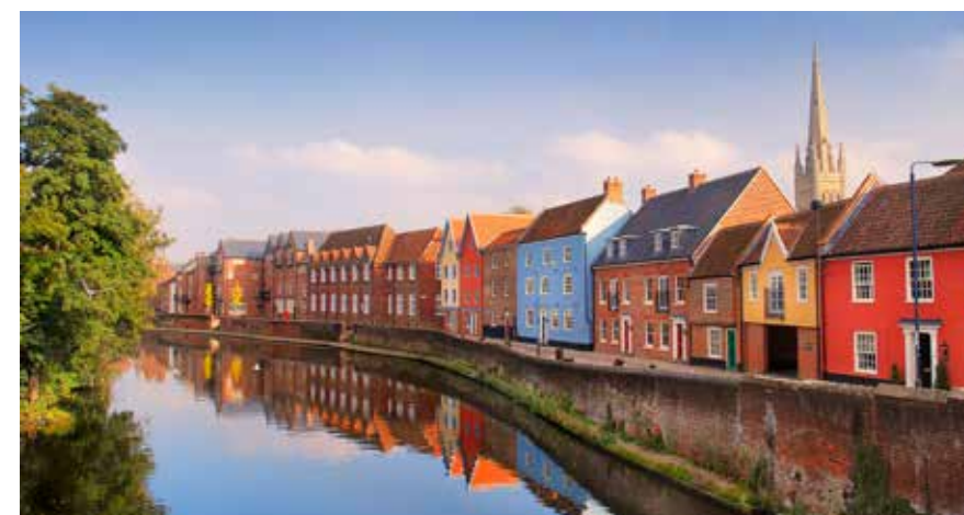
Overlooking the river Wensum and Norwich Cathedral.

"A beautiful city to be located so close to."