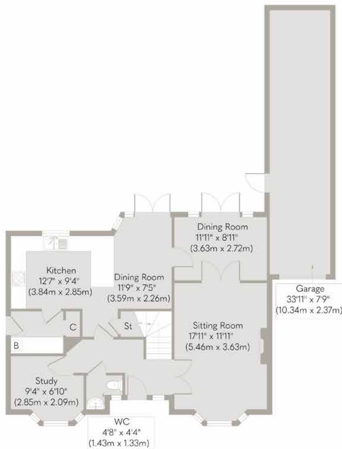
Ground Floor Approximate Floor Area 1044 sq. ft (96.99 sq. m)