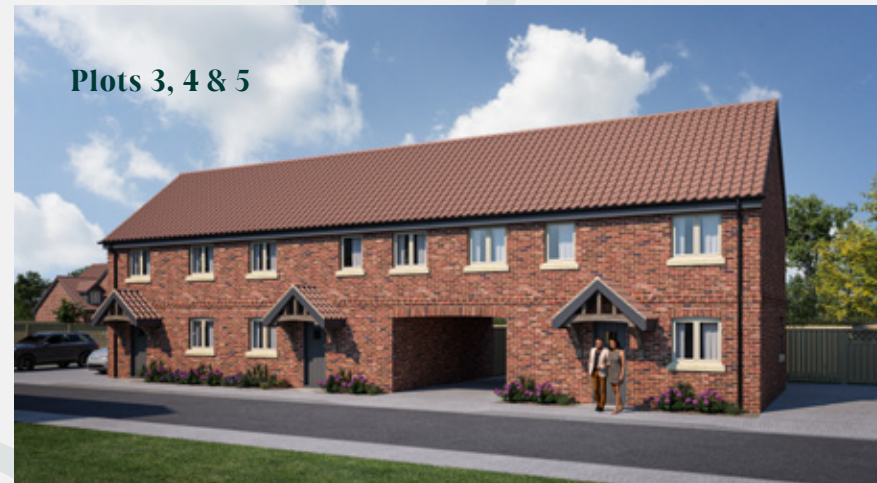
Plots 3, 4 & 5