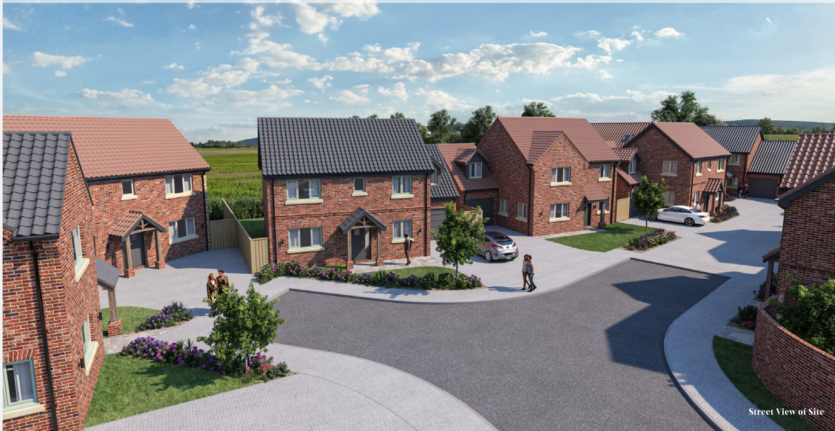
Street View of Site

Discover your new-build home amongst the seven property types available.