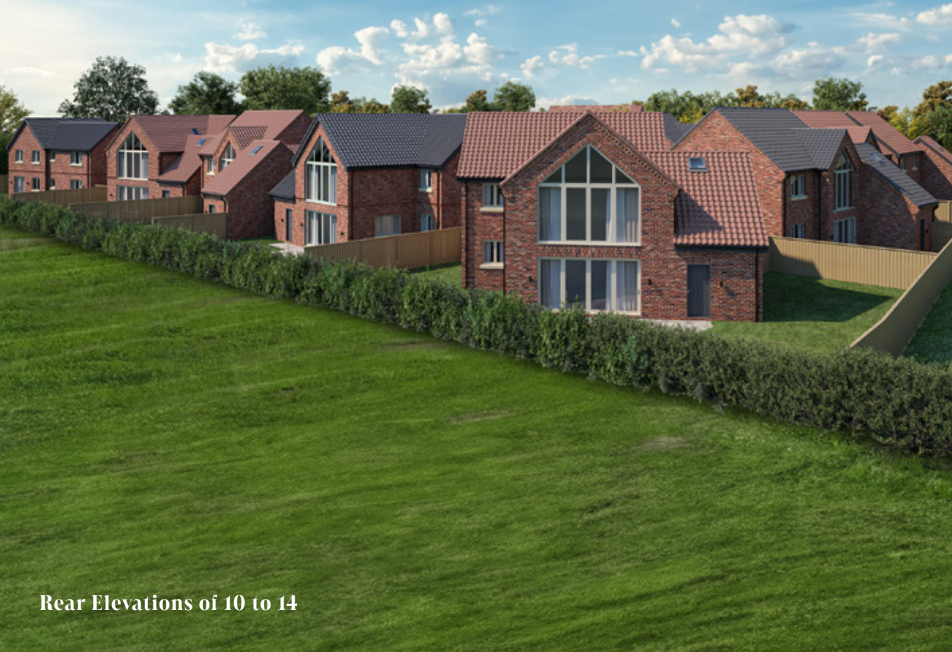
Rear Elevations of 10 to 14

With this extensive experience their management team has cultivated strong relationships with professional advisors, agents, and contractors. Their track record is a testament to their reliability and integrity, ensuring that every project they undertake meets the highest standards.