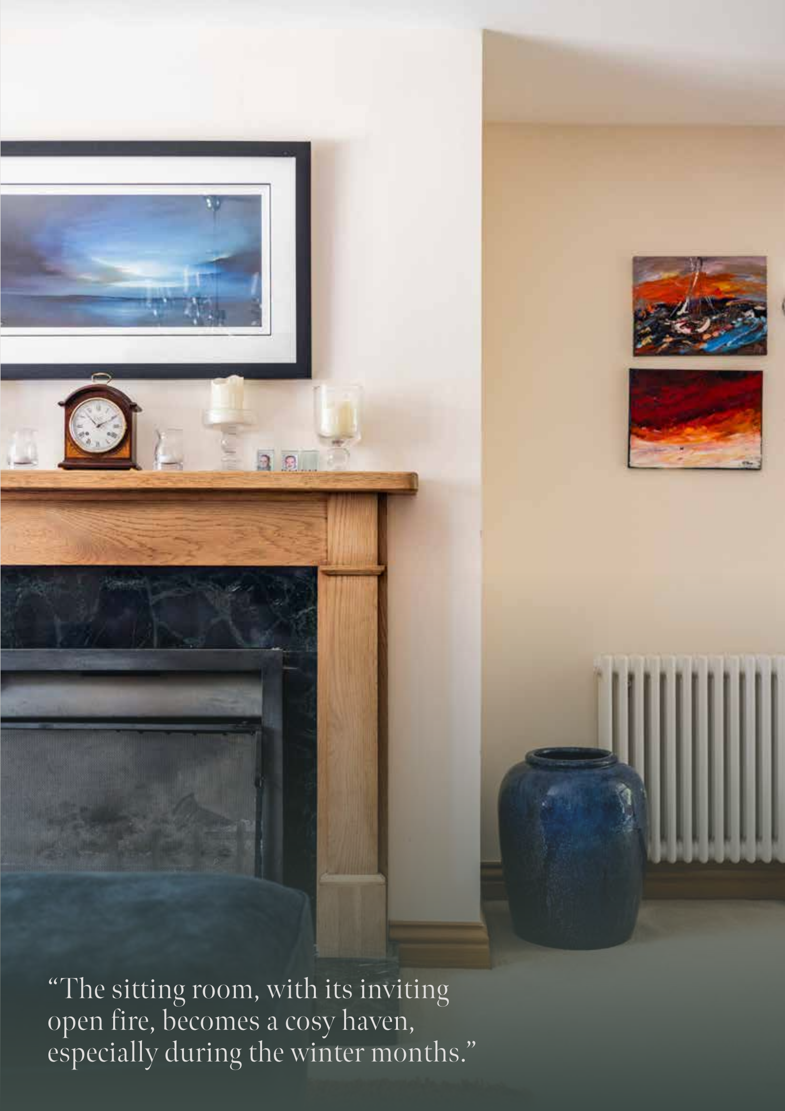
“The sitting room, with its inviting open fire, becomes a cosy haven, especially during the winter months.”