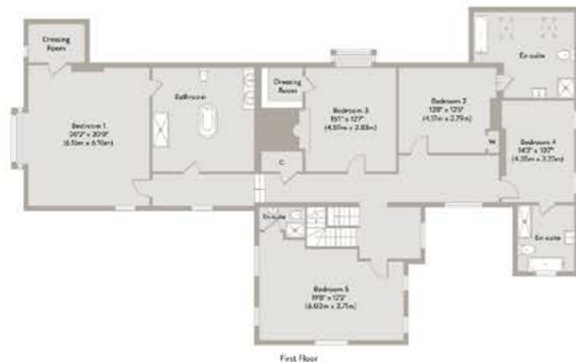
First Floor Approximate Floor Area 2209 sq.ft (205.18 sq.m)