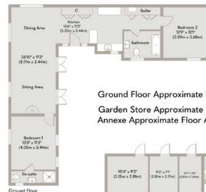
Ground Floor Approximate Floor Area 950 sq.ft (88.28 sq.m)