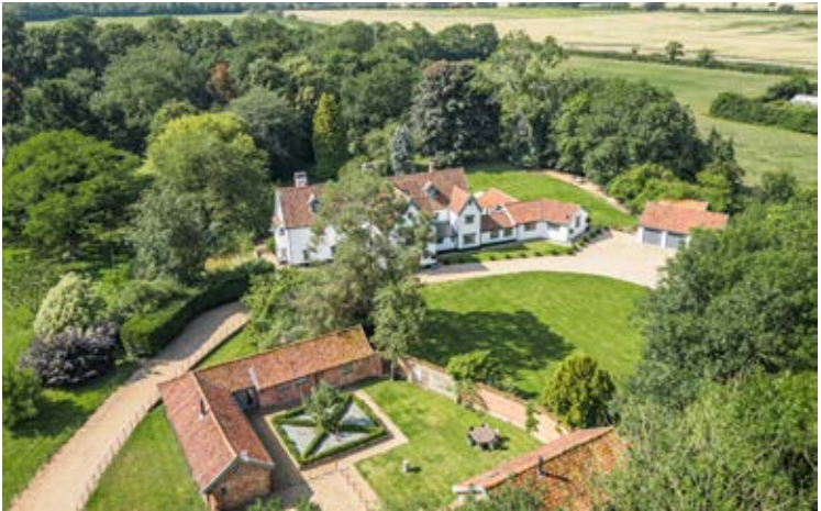
Orchard Farmhouse and surrounding countryside.

“Surrounded by enchanting woodlands with meandering walkways.”