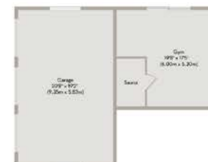
Garage Approximate Floor Area 986 sq.ft (91.57 sq.m)