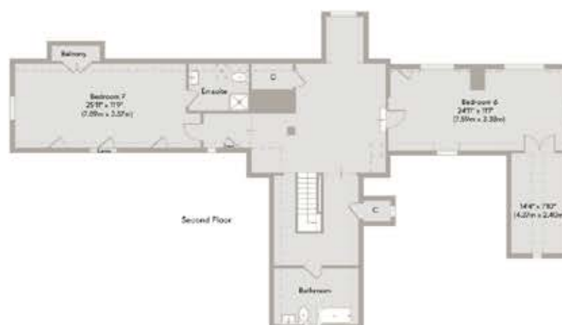
Second Floor Approximate Floor Area 1400 sq.ft (130.09 sq.m)