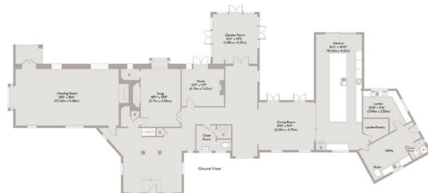
Ground Floor Approximate Floor Area 3632 sq.ft (337.43 sq.m)