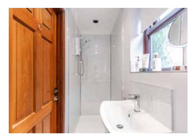
We love how peaceful, quiet and private it is here, yet close to everything you may need.