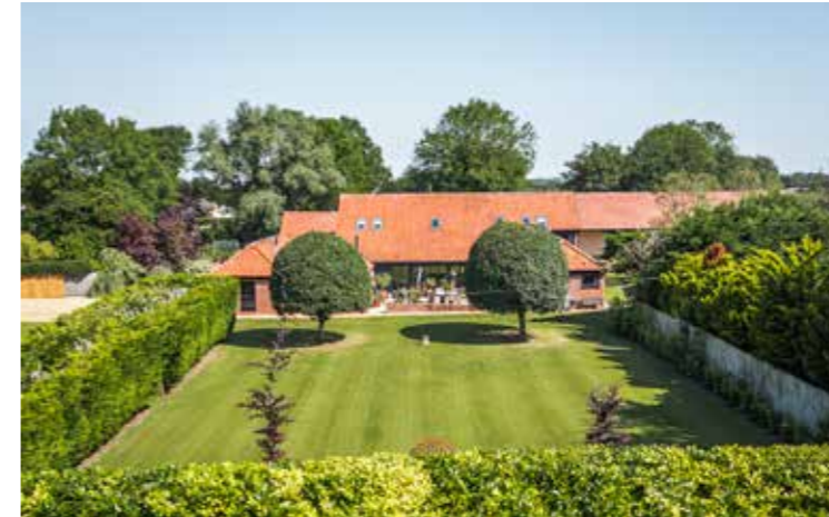
West End Barn rear garden.

“The village and surrounding area is full of cycling and walking routes around the quiet lanes.”