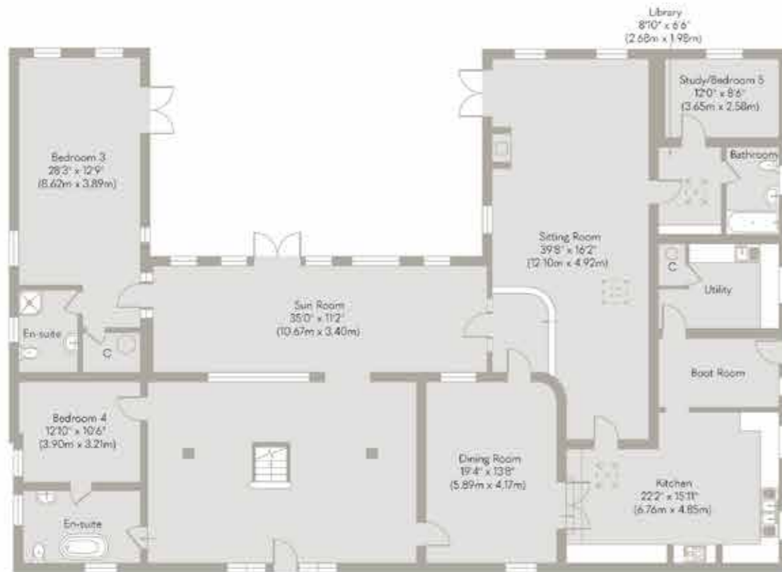
Ground Floor Approximate Floor Area 3,407 sq. ft (316.53 sq. m)