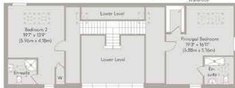
First Floor Approximate Floor Area 1,076 sq. ft (99.99 sq. m)