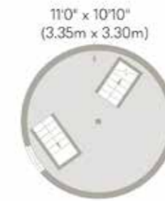
Second Floor Approximate Floor Area 79 sq. ft (7.29 sq. m)