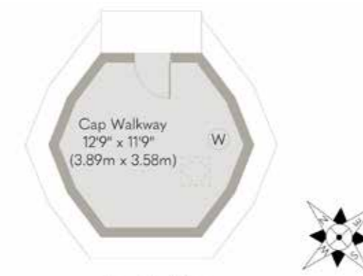
Fourth Floor Approximate Floor Area 117 sq. ft (10.91 sq. m)