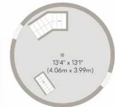
First Floor Approximate Floor Area 201 sq. ft (18.67 sq. m)

Whilst every attempt has been made to ensure the accuracy of the floor plan contained here, measurements of doors, windows, rooms and any other items are approximate and no responsibility is taken for any error, omission, or mis-statement. This plan is for illustrative purposes only and should be used as such by any prospective purchaser or tenant. The services, systems and appliances shown have not been tested and no guarantee as to their operability or efficiency can be given.