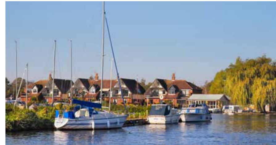
River Bure through Horning village.