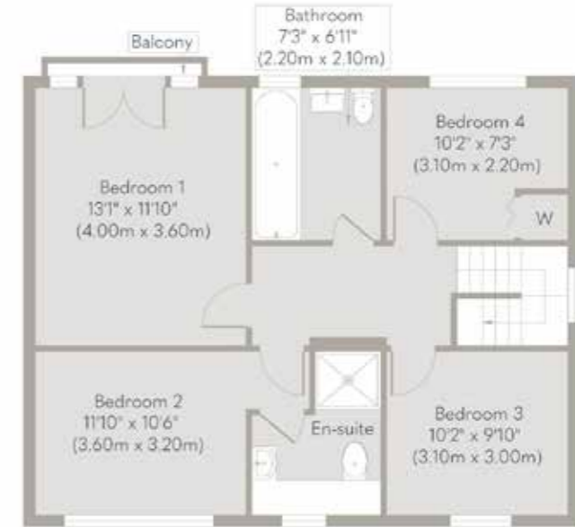
First Floor Approximate Floor Area 715 sq. ft (66.43 sq. m)