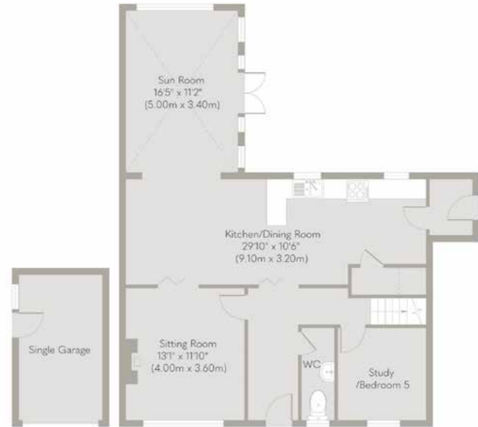
Garage Ground Floor Approximate Floor Area 927 sq. ft (86.15 sq. m)

Whilst every attempt has been made to ensure the accuracy of the floor plan contained here, measurements of doors, windows, rooms and any other items are approximate and no responsibility is taken for any error, omission, or mis-statement. This plan is for illustrative purposes only and should be used as such by any prospective purchaser or tenant. The services, systems and appliances shown have not been tested and no guarantee as to their operability or efficiency can be given.