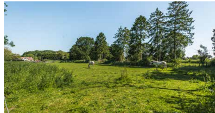
The Paddocks at Foxwood

“I love to sit in our bedroom and look out on the horses in the stables.”