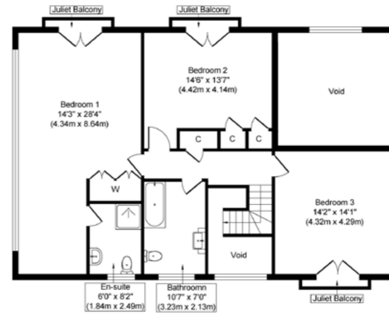
First Floor Approximate Floor Area 1027 sq. ft (95.41 sq. m)

Whilst every attempt has been made to ensure the accuracy of the floor plan contained here, measurements of doors, windows, rooms and any other items are approximate and no responsibility is taken for any error, omission, or mis-statement. This plan is for illustrative purposes only and should be used as such by any prospective purchaser or tenant. The services, systems and appliances shown have not been tested and no guarantee as to their operability or efficiency can be given.