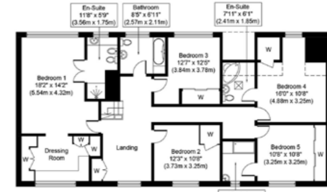
First Floor Approximate Floor Area 1568 Sq. ft. (145.7 Sq. m.)