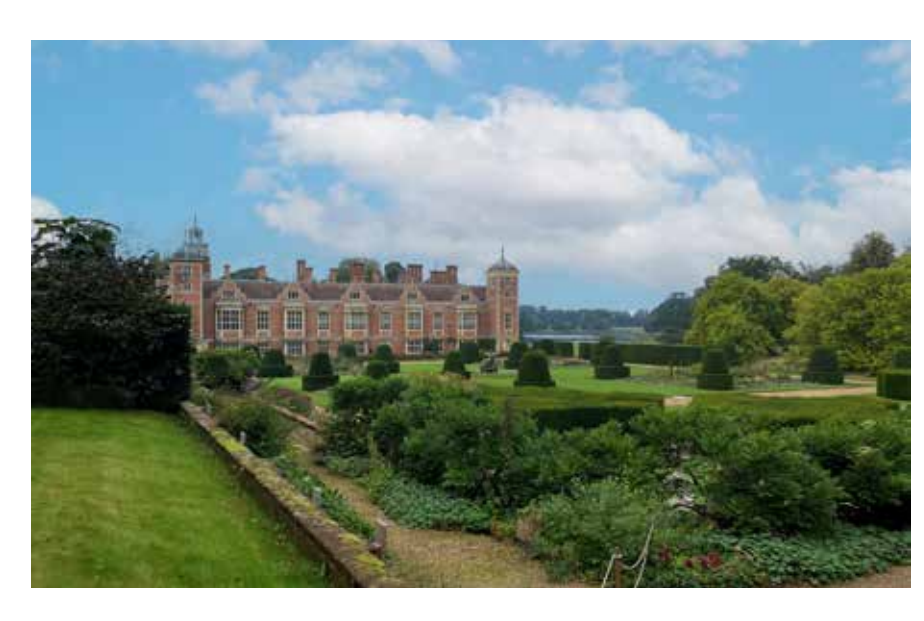
"There are some great walks nearby, Blickling has been a favourite place."